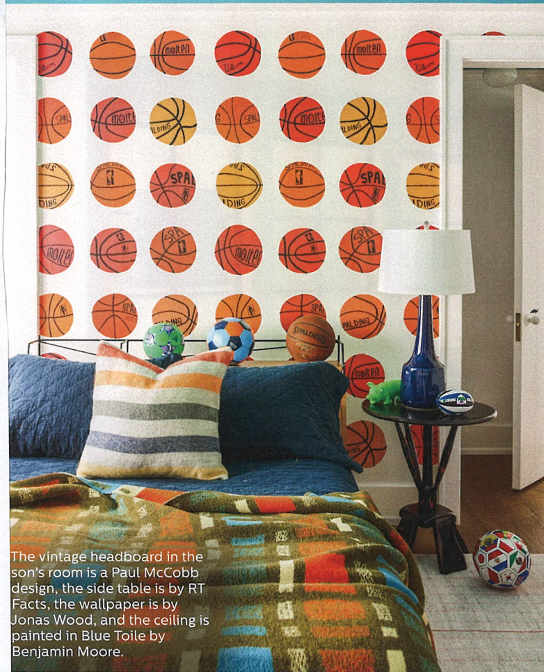
The vintage headboard in the son's room is a Paul McCobb design, the side table is by RT Facts, the wallpaper is by Jonas Wood, and the ceiling is painted in Blue Toile by Benjamin Moore.