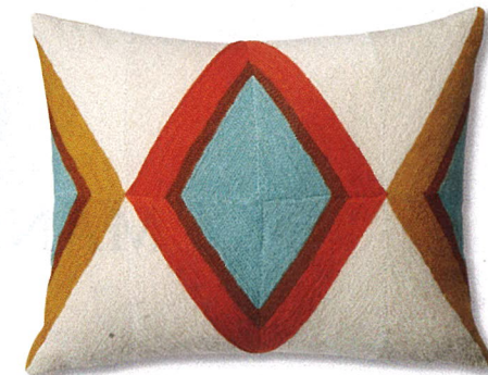
Wool pillow by Lindell & Co.