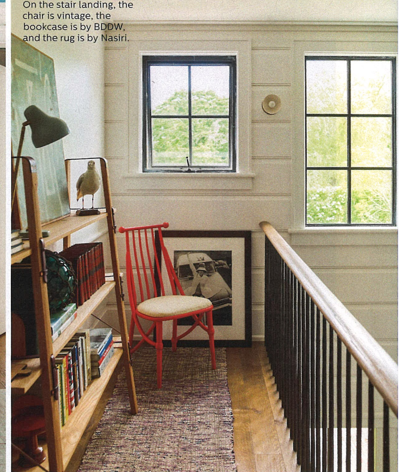
On the stair landing, the chair is vintage, the bookcase is by BDDW, and the rug is by Nasiri.