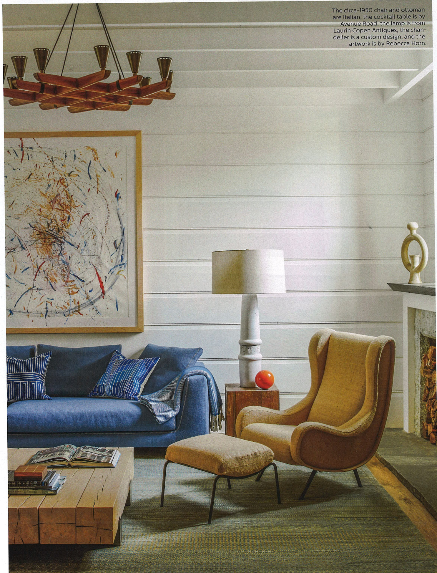
The circa-1950 chair and ottoman are Italian, the cocktail table is by Avenue Road, the lamp is from Laurin Copen Antiques, the chandelier is a custom design, and the artwork is by Rebecca Horn.