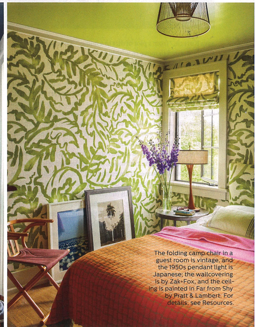
The folding camp chair in a guest room is vintage, and the 1950s pendant light is Japanese; the wallcovering is by Zak+Fox, and the ceiling is painted in Far from Shy by Pratt & Lambert. For details, see Resources.